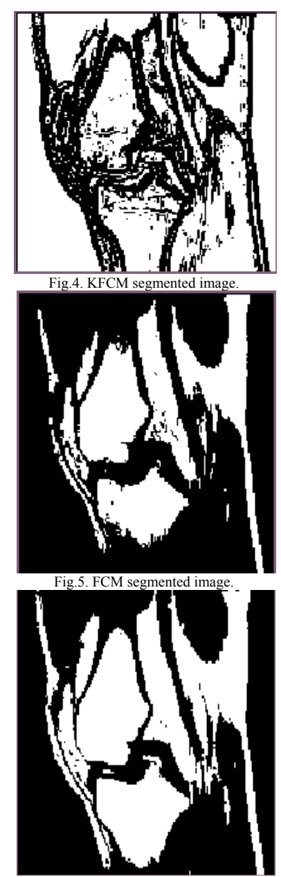
Fig.6. image segmented by using proposed method.