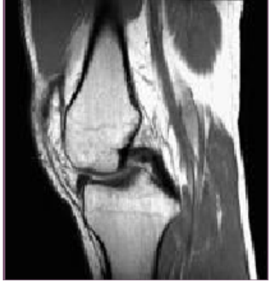
Fig.3. Original image.

To show the performance of proposed method, simulation results are shown. The following figures show the simulation results of the segmentation methods like: FCM, KFCM and also the results of proposed method. Fig.3, 4, 5&6 shows the original image, KFCM segmented image, FCM segmented image and the image segmented using the proposed algorithm respectively. These simulation results provide qualitative analysis of methods. These all results are obtained by implementing the listed algorithms in MatLab using image processing toolbox.